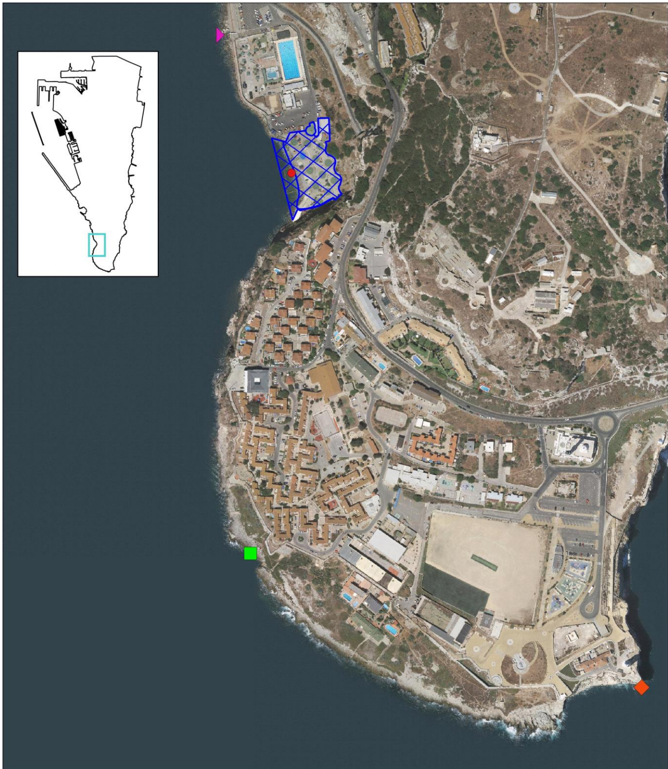
Figure 1. Location of Little Bay, extent and bathing water monitoring point.